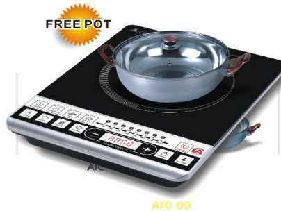
Figure 1 Stove

The solar is the primary source of supply for the cooker. Solar is made up of photovoltaic cells that convert solar energy into electrical energy in the form of direct current. PV modules generate electricity from the sun. Due to the non-linear characteristics of the PV system, the output power is not constant all the times throughout the day. In this design, batteries, and DC-to-DC converters work together with PV systems to regulate the voltage of the PV systems.